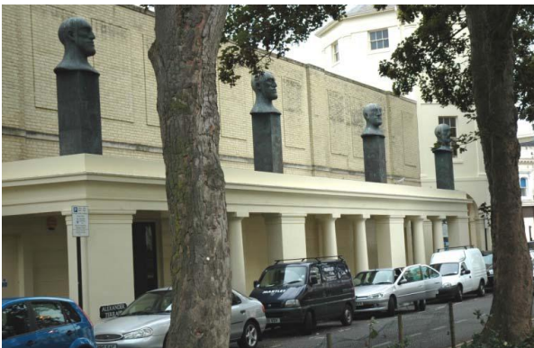
Desert Quartet 1989. Worthing, West Sussex. Elisabeth Frink.