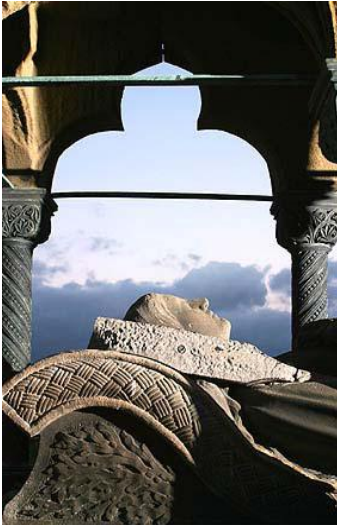
Monument to Grace Darling 1844. Bamburgh, Northumberland Anthony Salvin & C. Raymond Smith

Telephone: 020 7490 5001 Website: www.PMSA.org.uk Email: PMSA@btconnect.com